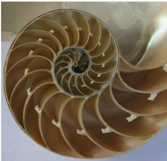
A chambered nautilus shell is an example of a fractal found in nature.

https://www.treehugger.com/watch-the-beautiful-visualization-of-the-numbers-of-nature-4867920