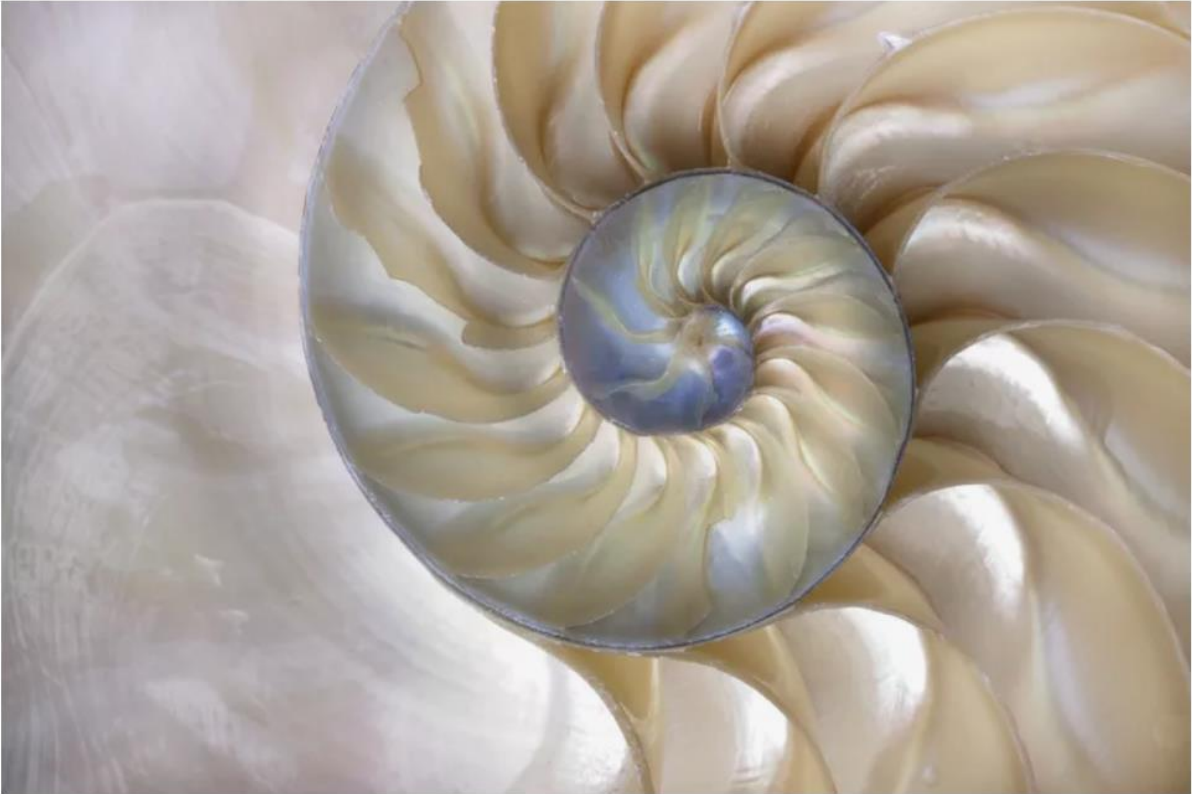
A seashell is one of the most well-known examples of the golden ratio spiral in nature.

https://www.treehugger.com/watch-the-beautiful-visualization-of-the-numbers-of-nature-4867920